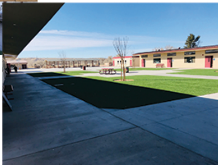
Beautiful and clean RPMS