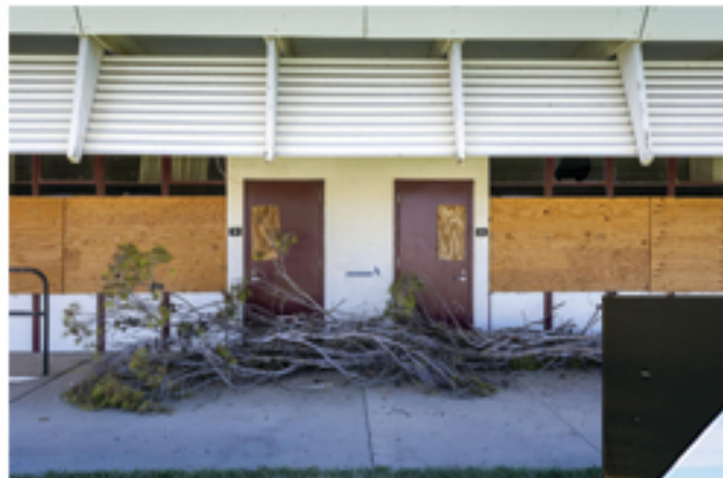
A local, rundown campus

The staff does a lot for the school to keep it clean, and the students should respect that and help keep it clean. Our school is a lot nicer than some other schools, and we should keep it that way by making it clean. That means no vandalizing bathrooms and no littering. Lately, however, there has been quite a bit of these things, and it's not right. If we all work as a team to keep it clean, then we will continue to have a great, healthy, and clean campus.