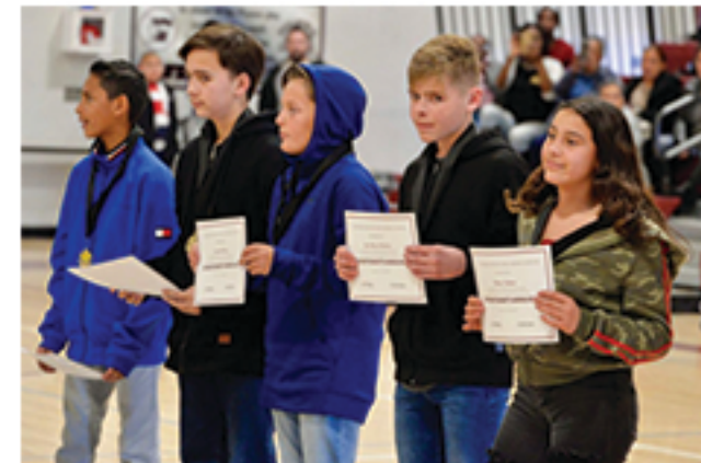
Students receive awards for Honor Roll.

On Friday, January 24, 2020, Riverside Prep hosted an Honor Roll assembly to recognize students who had a 3.0 GPA or higher. The assembly had three different sections: one for students with a GPA 3.2 to 3.69, one for 3.7 to 3.99, and one for 4.0. Students with a 4.0 GPA were celebrated as being on the Superintendent's Honor Roll list, the highest honor. Congrats to all who made it! Good job on your hard work and keep working towards the great success.