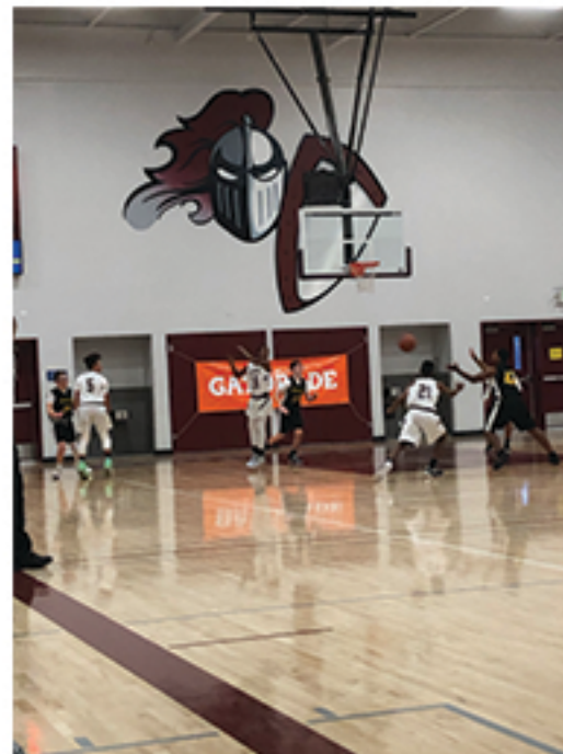
The Boys' Basketball team dominated against Boron.

The next home games are on February 3rd and March 2nd. Be sure to come on out and support your fellow Silver Knights!